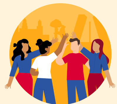
Settle in smoothly

Read more about the service by clicking here and let's get started!