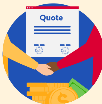
Get a free quote