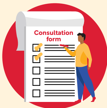
Fill out our consultation form