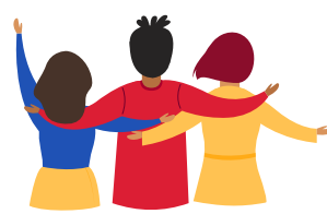
Citylife Madrid Community