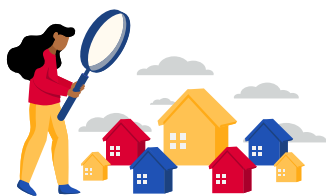
Madrid Roommate & Flat Search