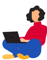
Work, Internships & Student Jobs Madrid