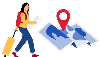
Trips – Never Stop Exploring