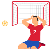
Citylife Sports Club